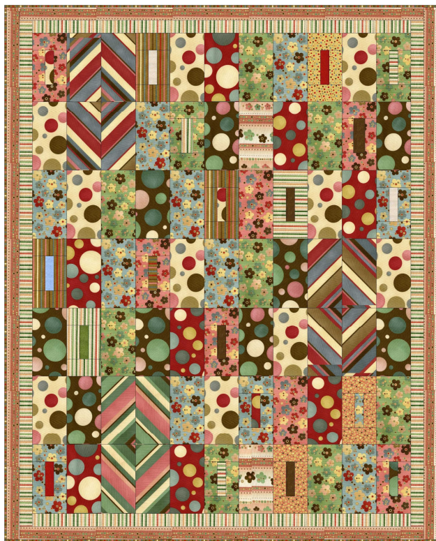
Quilt Size 50" x 62 Finished Block Size 4" x 8"